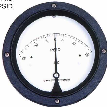
Model 120 15-0-15 PSID 4-1/2" Dial Bi-Directional

Due to precision sizing of piston and body bore, leakage across piston will not exceed 15 SCFH air at 100 PSID at ambient temperature.