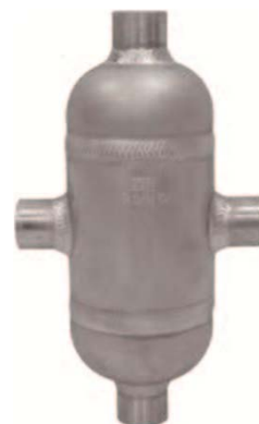
Mechanical accessories, series MA.93