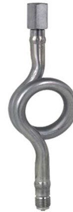
Mechanical accessories, series MA.94