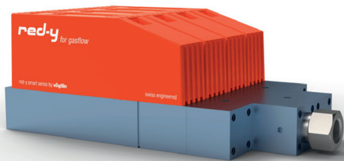
Fig. 3 Vögtlin offers modular MFC systems based on your demands and requirements.