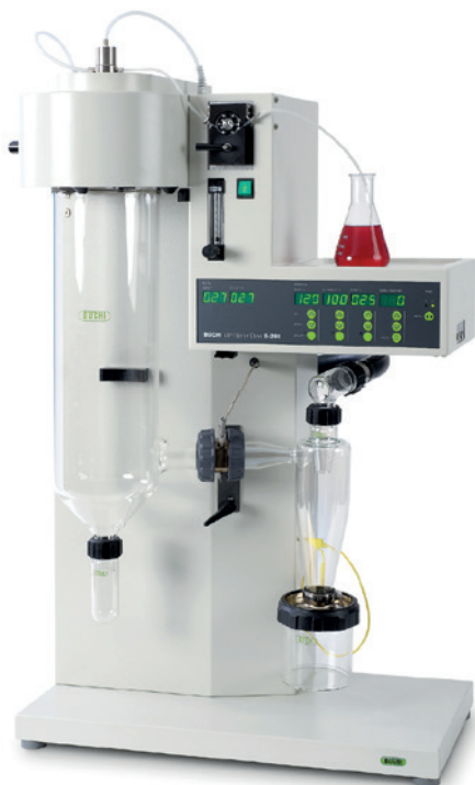
Fig. 4 Mini Spray Dryer B-290 from Büchi with a built-in Vögtlin variable area flowmeter

Gas flow readings are taken 3 times per second and can be stored using data logger software. Traceability of production can be guaranteed.