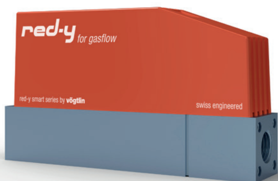
Fig. 2 Thanks to its high accuracy and repeatability, its long term stability and perfect temperature compensation, the digital mass flow controller red-y smart series from Vögtlin is especially suited for spray drying processes. High turndown ratio, easy and reliable operation and a wide range of options make this device an economical way to get better results within your spray dryer application.